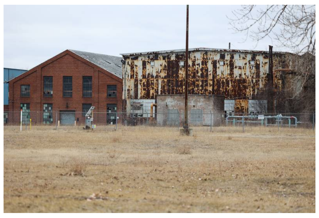
Buildings at former U.S. Steel site continue to deteriorate along Collins Street in Joliet.