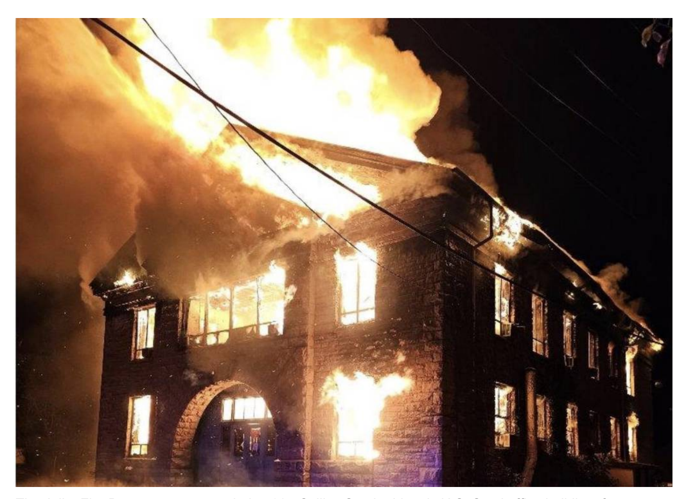
The Joliet Fire Department responded to 927 Collins St., the historic U.S. Steel office building, for a report of a structure fire on Saturday, Sept. 7, 2024.

<u>Joliet police</u> and fire departments have responded to an ongoing series of incidents at the former steel mill site in the last 10 years.