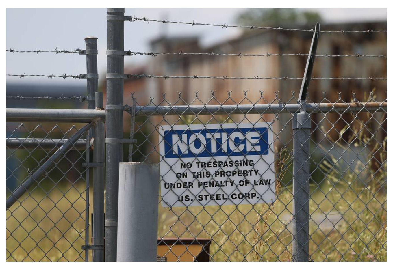
A No Trespassing sign is posted on the gate of the abandoned U.S. Steel Mill on Saturday July 13, 2024 in Joliet.