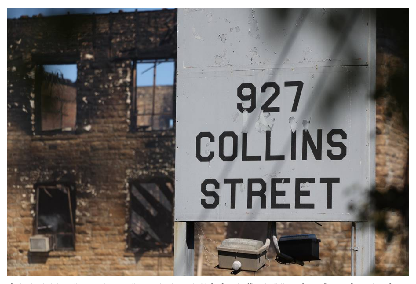
Only the brick walls remain standing at the historic U.S. Steel office building after a fire on Saturday, Sept. 7, 2024 in Joliet. The historic building along Collins Street was engulfed in flames early Saturday.

Clearing out the old buildings still standing on the property could remove the temptation that has made the site susceptible to trespassers.